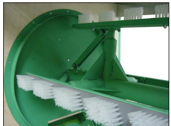
Rotor with brushes

Please contact us for detailed information or meet us at www.westrup.com